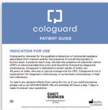
PATIENT GUIDE INSTRUCTIONS