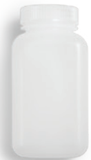
BOTTLE OF LIQUID (PRESERVATIVE)