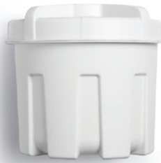
STOOL COLLECTION CONTAINER