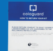
How to Return Your Kit